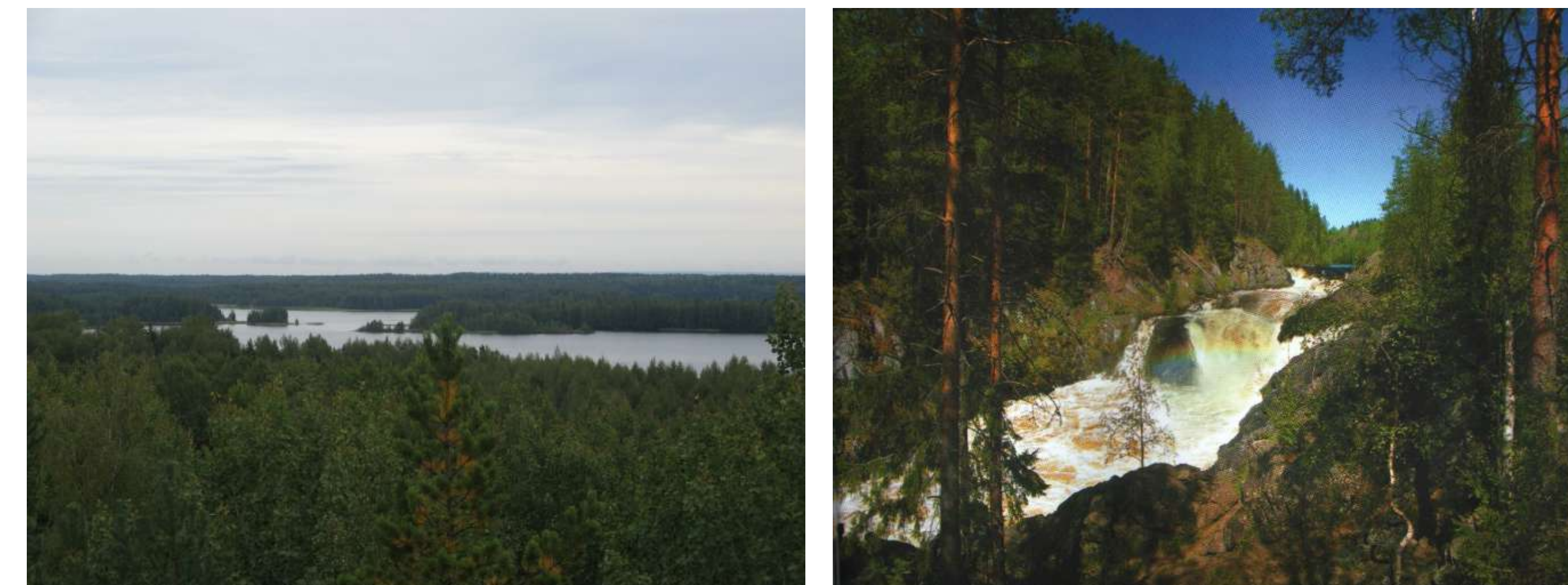
Fig. 2: Karelian pine forests.