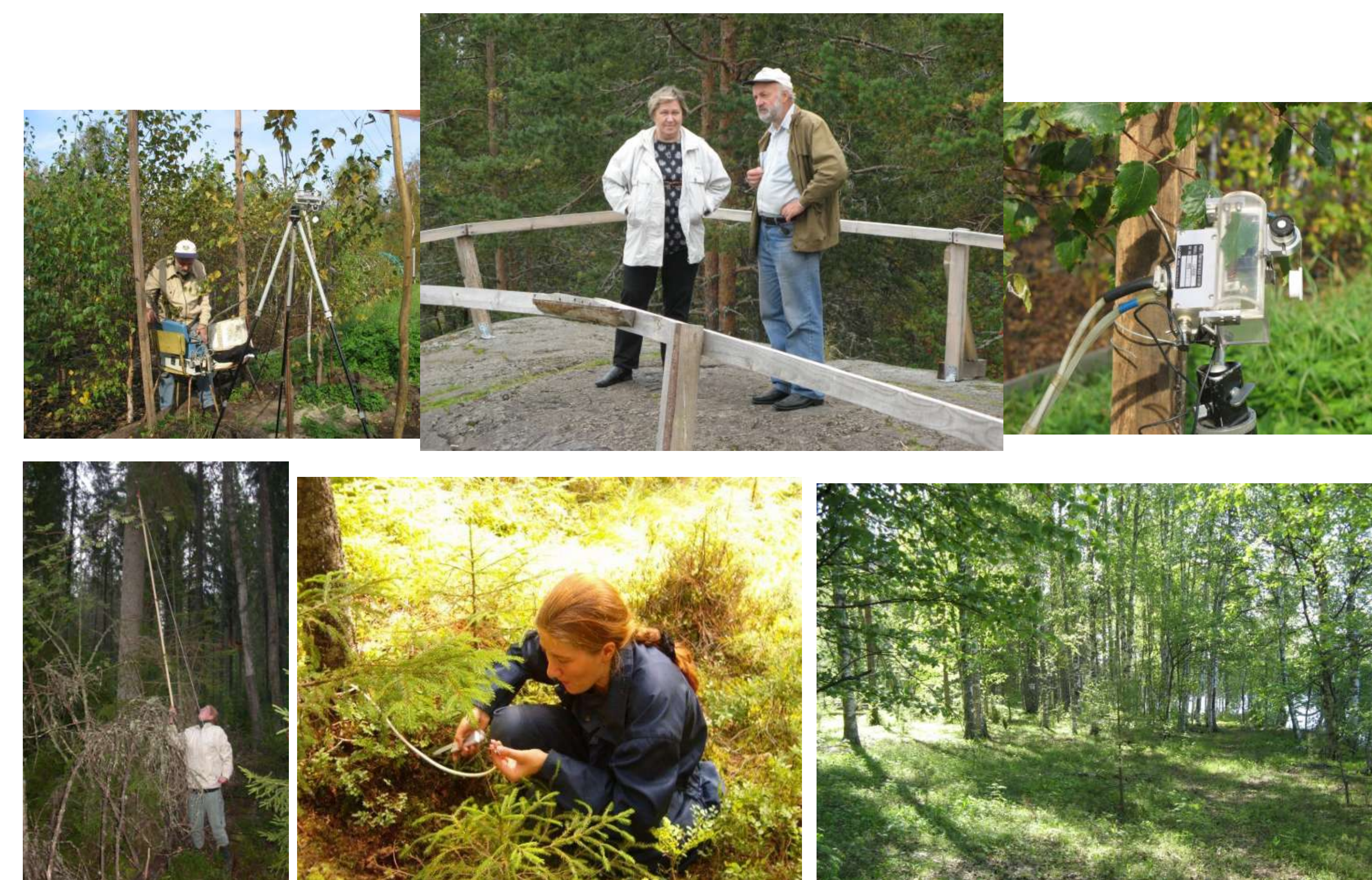
Fig. 4: Field studies

In addition to stationary system of measurements, portable equipment was used to perform ecological measurements in different forest types (Fig. 4). We found that needle transpiration capacity ( 41.7 \text{ mm ha}^{-1}\text{yr}^{-1} ) and xylem water conductivity ( 101 \text{ ton m}^{-2} \text{ yr}^{-1} ) were constant in the forest types of different productivity. On the base of analysis of our own data and data available in literature, it have been found that annual photosynthetic productivity averaged over crown in the middle-aged pine trees ( 1.52 \pm 0.13 \text{ g g}^{-1}\text{year}^{-1} ) is constant in the similar climatic conditions (Karelia, Finland, Sweden). Using portable system of measurement of gas exchange (Li-Cor), photosynthesis and respiration of coniferous trees exposed to toxic pollutants were conducted in the north of Karelia, (Kostomuksha Mining Plant ("Костомукшский ГОК") and on Kola Peninsula. Monchegorsk and North Nickel Mining Plants ("Мончегорский комбинат", "Североникель"). Among the results of this research, we estimated photosynthetic sink of \text{CO}_2 into pine forests in normal (background) conditions and near large sources of industrial pollution.