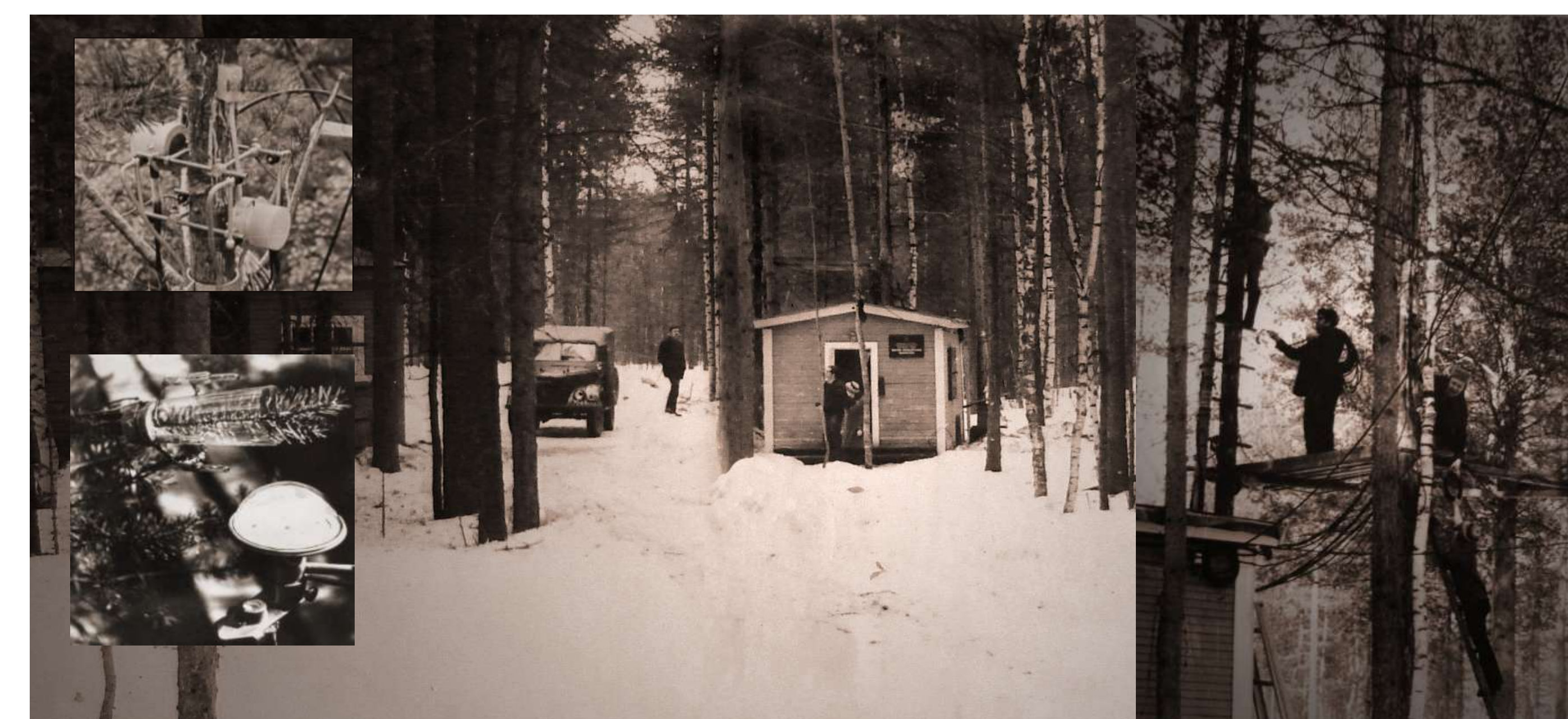
Fig. 3: "Gabozero" research station

Dynamics of daily and seasonal \text{CO}_2 exchange in the woody plant shoots was defined and quantified and developed a model of the potential \text{CO}_2 exchange as function of environmental factors. Thereafter, we investigated effects of the main regulatory environmental factors on water regime and photosynthesis. We found that the high rate of these processes was observed within a large range of the hydro-meteorological factors, suggesting that the species under study have adapted to the wide range of growth conditions.