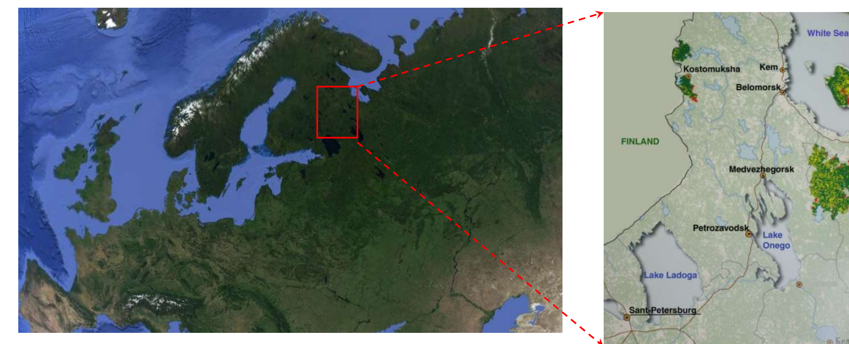
Fig. 1: Geographical location of the research areas.

During more than 40 years ecophysiological investigations of woody plants ( Pinus sylvestris L., Picea abies L., Betula pendula Roth.) responses to different natural and anthropogenic factors in conditions of the north-western Russia (Eastern European taiga forest) have been conducted (Fig. 1-2).