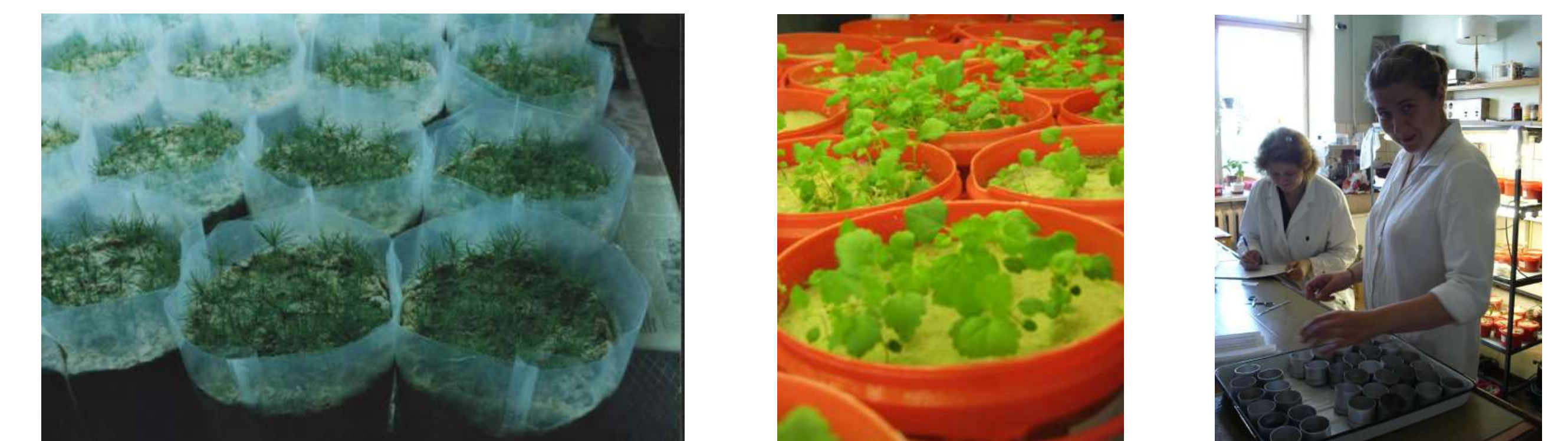
Fig. 5: In the laboratory

We assessed the acquisition of efficient and biological (internal) ratio optima N:P:K for Pinus sylvestris L., in the vegetative tests (53:28:19 and 55:8:37 respectively) (Fig. 5). Comparison of these values with those obtained for Pinus sylvestris L. under natural growth conditions showed their affinity with an internal optimum. Our finding indicates that the optimization of mineral nutrition in nature follows the path of stabilization of the internal (biological) optimum. These results are perhaps the experimental confirmation of the idea of a plant organism development strategy, which is not aimed to achieve maximum economic efficiency but to maintain some steady state, favorable to life of the species.